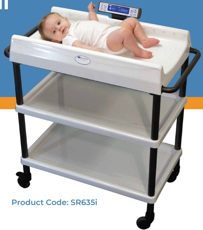
Product Code: SR635i