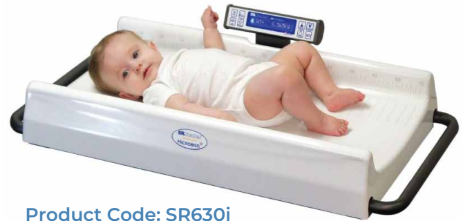
Product Code: SR630i